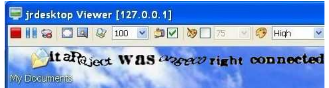
Figure 3: A VNC session with an adapted distorted image

feedback. Here a legitimate user may expect such a string to be displayed anywhere on the screen. In contrast, for a machine attacker, it may be difficult to identify the distorted message from a screen-capture, specifically, when the message is blended with the background. Additionally, there is no need to display the distorted image right after login; e.g., a short, random delay can be added to confuse the attacker even further. The attacker may need to forward a video clip to a human solver to perform a relay attack, which would increase the cost of such an attack.